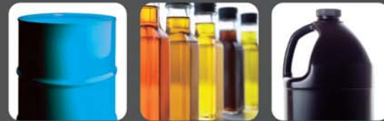
Petroleum and Organic Solutions Oils and Fats Detergents