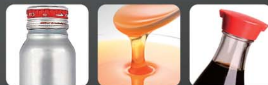
Beverages and Fruit Juice Jams, Honey, Liquid Sugar, Syrups Condiments, Sauces, Soups