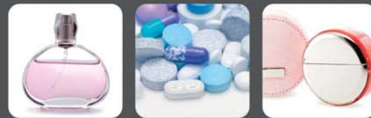
Fragrance and Food Additives Pharmaceutical Products Cosmetics

Refractive Index is a common quality standard measure for pharmaceutical or chemical products. Measurements need to be taken at a constant temperature, commonly 20°C, 25°C, and 40°C. The RX-i series are equipped with the internal Peltier Thermo-Module, and measurement starts once the target temperature is reached. Thermo-Module, and measurement starts once the target temperature is reached.