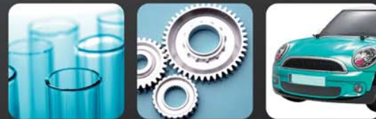
Chemical Solutions Cutting Oil and Quenching Oil Antifreeze and Coolants

The concentrations of industrial solutions are often monitored. Examples include water-based cutting oils and cleaning solutions, hydrogen peroxide, coolants, and alcohol solutions. Although the Brix scale is commonly used, user scales can also be programmed to display converted sample values.